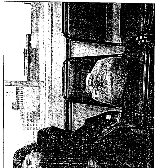
She is waiting room of Barnes-Jewish Health Care in St. Louis to keep out of the cold. She has had just given up the last of her four children for young men in St. Charles.

you what to such an existence. She's lived all over the country and has an associate's degree in business administration from Pasadena City College in Pasadena, Calif. But 4 1/2 years ago she learned she had multiple sclerosis and that coupled with severe depression and a host of other physical problems meant she could no longer work or care for her two younger sons who are now staying with their father in North Carolina. An older son is staying with her father, a stroke victim who lives in Breckenridge Hills. In St. Louis, she is now staying with their father in North Carolina. An older son is staying with her father, a stroke victim who lives in Breckenridge Hills.